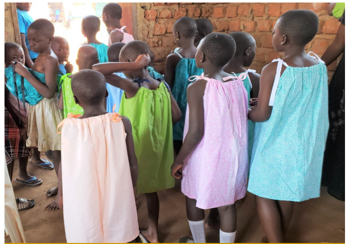
Bukuya girls ready to show and tell fellow students