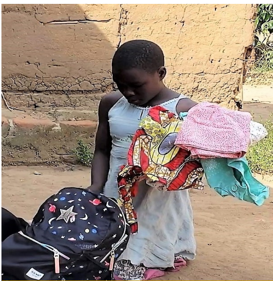
Bukuya girl will try her dresses on later