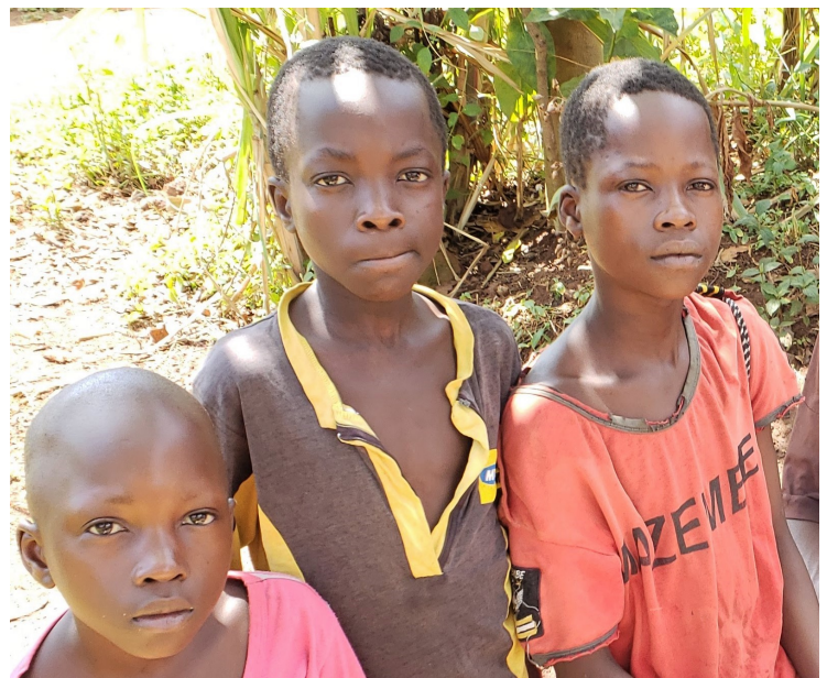
SCHOLARSHIP RECIPIENTS by individual sponsors 3