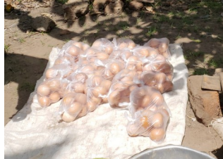
The eggs are ready for recipients