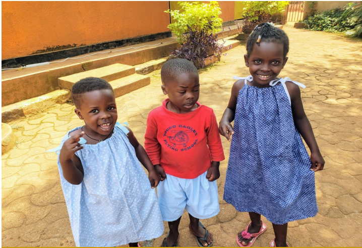
Kawempe village trio