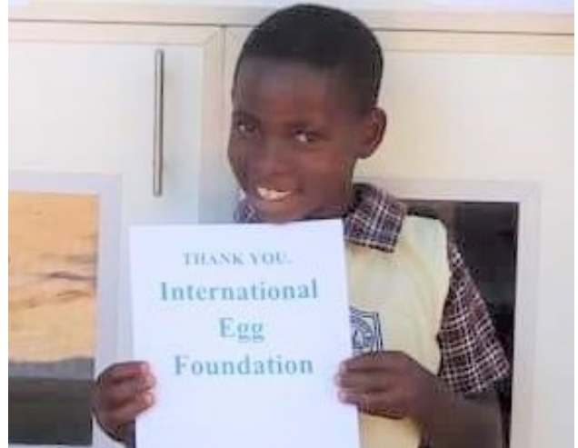
The children look forward to more eggs, chicken and hands-on education