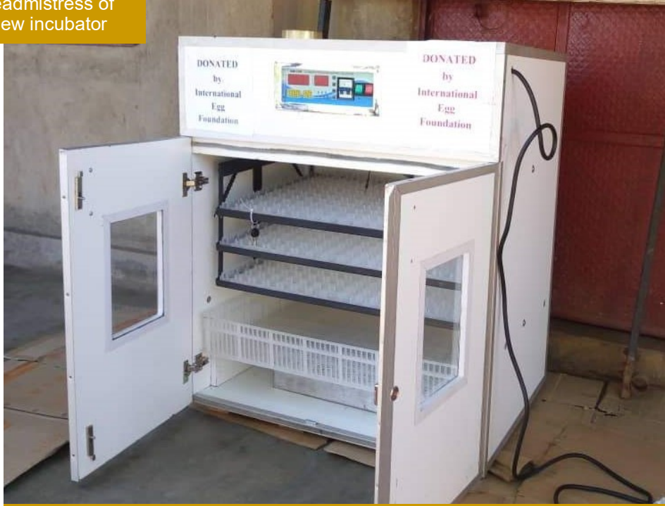
The new incubator