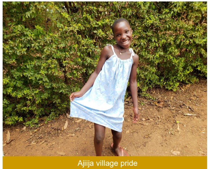
Ajijja village pride