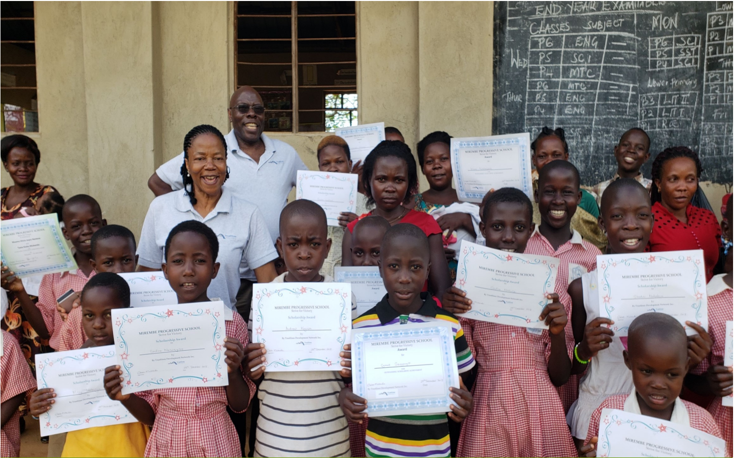
TOP: the 18 one-term and two one-year scholarship recipients BOTTOM: four one-year recipients