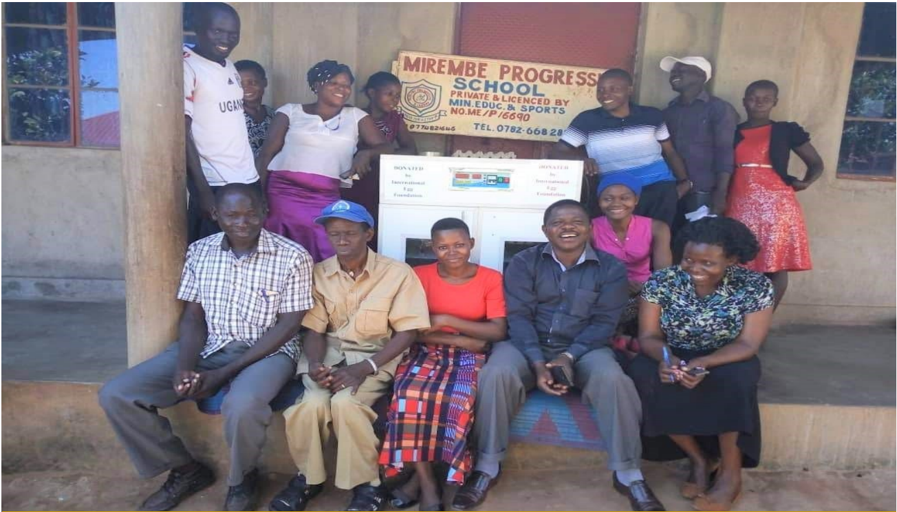
Even the staff at Mirembe Progressive School came to check out the incubator!