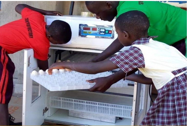
Students trying out the incubator