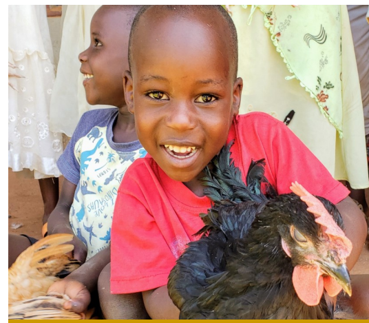
Happy future egg/chicken suppliers in Ajiija village

* MAIN SPONSOR: International Egg Foundation 1