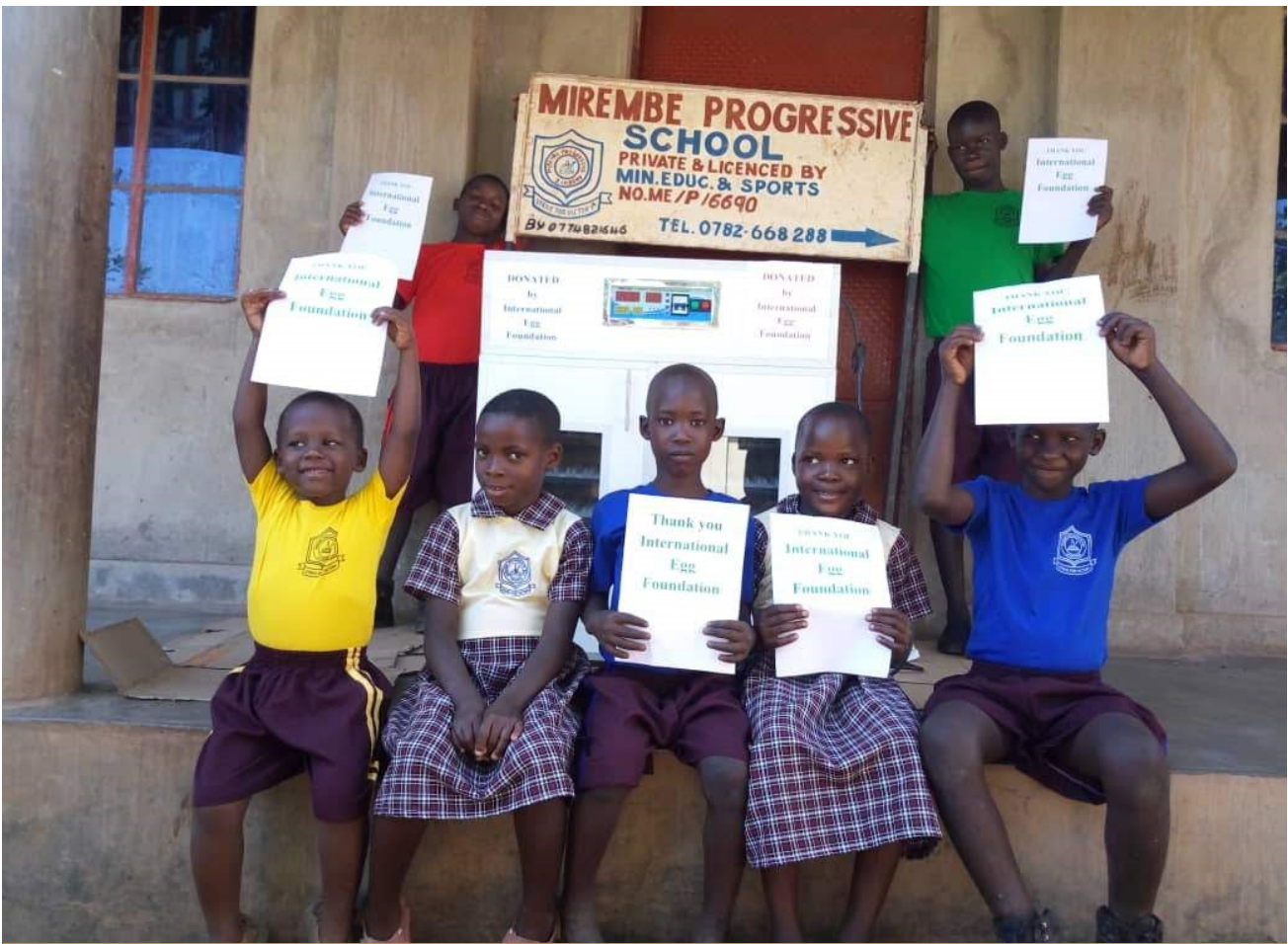
Teachers and children are excited about the possibilities of housing the egg incubator