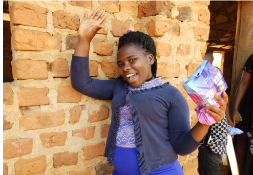
A Bukuya village recipient

We make a difference One project at a time One family at a time One child at a time and One pad at a time For the cost of 2 cups of coffee, we can buy a pads kit that will last a girl one year or longer