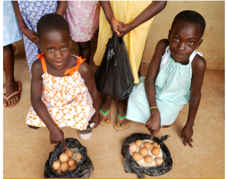
Recipients in Ajiija Village show off their eggs and starter chicken feed