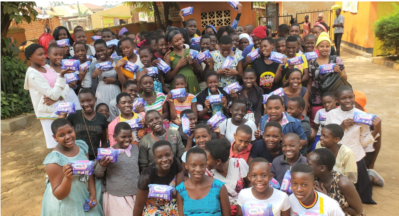
Pad recipients at New Era Primary School in Kawempe, 5 miles northwest of Kampala