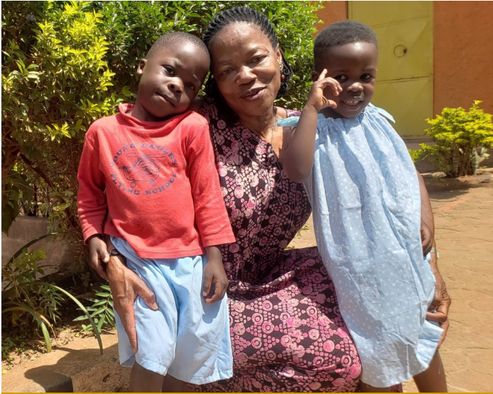
Kawempe village lucky ones