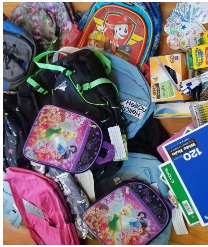
Thanks for the backpacks & school supplies you collected