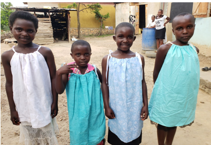
Thank you from Bujjuuko recipients