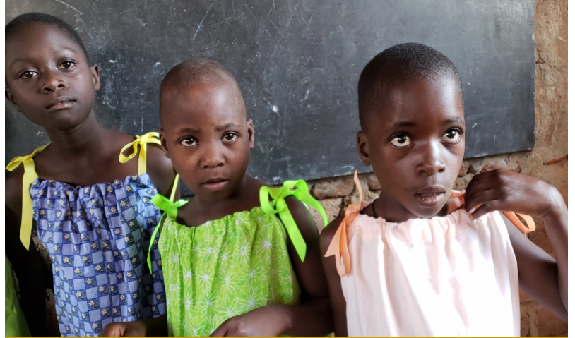
Bukuya village close up - are these dresses ours for real?